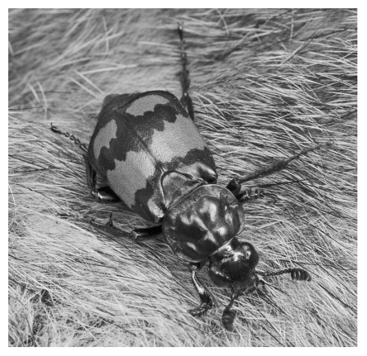
Sexton beetle

Parish Magazine adverts. Advertisers will be contacted very shortly with a view to re-advertising in the magazine. Advertising is the lifeline of the magazine so anyone wishing to advertise please make contact with the Clerk.